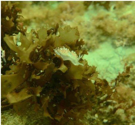
Flabellina verrucosa nudibranch