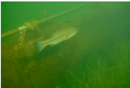
L-R: Juvenile bass

Circleville Dive Center, Circleville, OH 4-24 & 4-26. I was in Ohio the week of the April 23 to visit my daughter who lives in Columbus, make a couple of dives with my Columbus dive buddies, and attend a weekend workshop and dinner on underwater archaeology, sponsored by the National Museum of the Great Lakes (Toledo, OH) and the Marine Archaeological Survey Team (MAST) (Forthcoming June newsletter). Here are some shots from the quarry dives (50°, 50 minutes, 21', 0-5' vis).