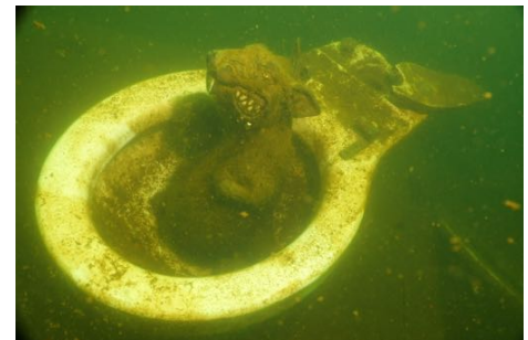
Dirty (toilet) rat